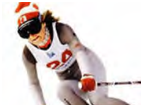
Kathy Kreiner Timmins Ski Racers 1 World Cup GS win 7 World Cup podiums 1972, 1976 & 1980 Olympics