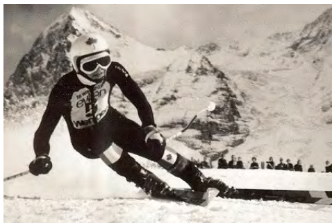
Dave Irwin Loch Lomond Ski Area 1 World Cup DH win, 2 World Cup podiums, 1976, 1980 Olympics