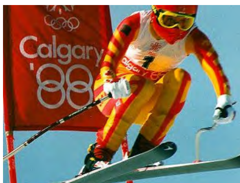
Lauri Graham Osler Bluff Ski Club Six World Cup victories, 1980, 1994 & 1988 Olympics