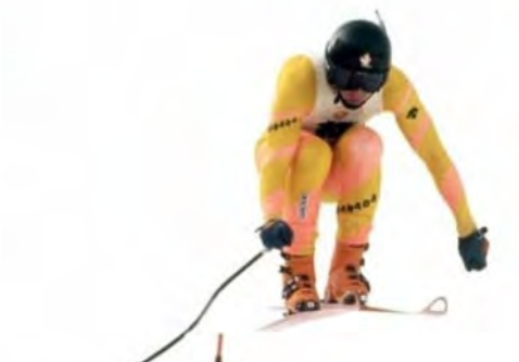
Steve Podborski Craigleith Ski Club 1st (and only) NA World Cup season title in DH, 8 World Cup DH wins, 20 World Cup podiums, 1980 Olympics