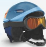
$3,000 SPORTING LIFE GIFT CERTIFICATE