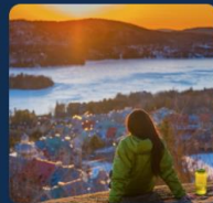
Ski Trip for Two