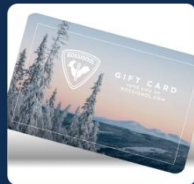
$2K Rossignol Gift Card