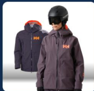
HH Ski Suit x 2