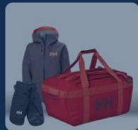
$500 HH Merch + Bag