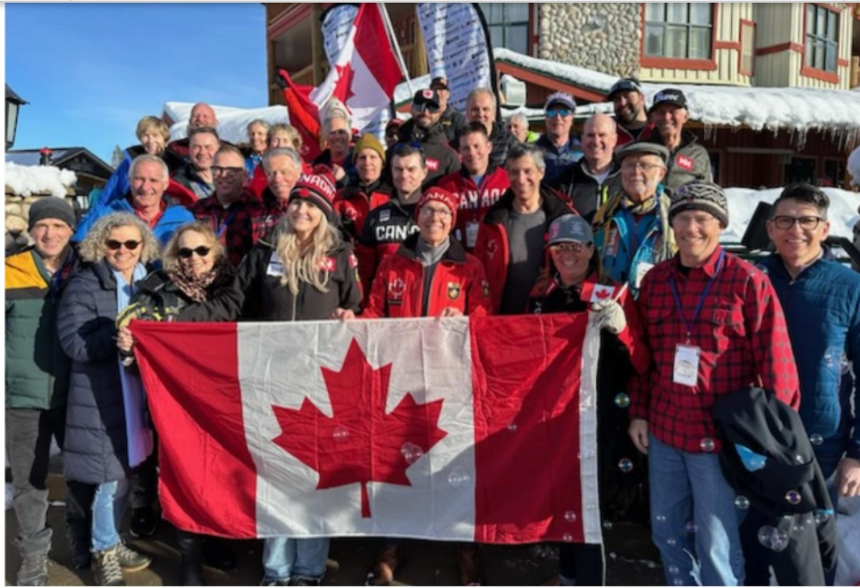
41 Canadians at WCM